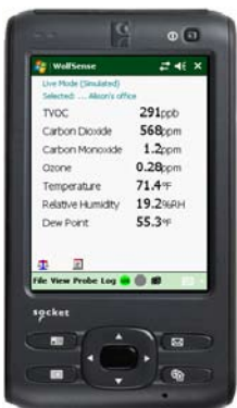
PH-12S Pocket PC