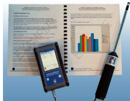
WolfSense ARG report

WolfSense PC software allows logged data to be down-loaded to your PC for review, graph generation, cut & paste reporting and/or simple export to Excel